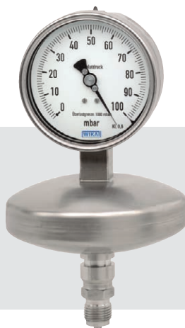
Model 532.51 – 532.54